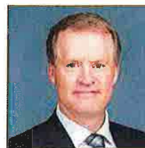
Associate Minister of Water Grant Hunter