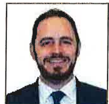
Minister of Education and Childcare Demetrios Nicolaidis