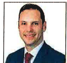
Minister of Hospital and Surgical Health Services Matt Jones