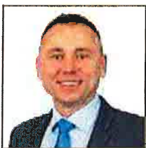
Minister of Tourism and Sport Andrew Boitchenko