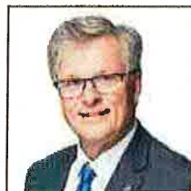
Minister of Advanced Education Myles McDougall

New members of cabinet include Myles McDougall, Andrew Boltchenko, and Grant Hunter (who will also serve as the new Chief Government Whip).