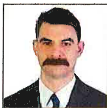
Minister of Municipal Affairs Dan Williams