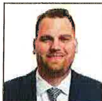
Minister of Jobs, Economy, Trade, and Immigration Joseph Schow