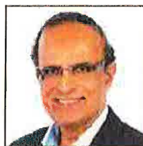
Associate Minister of Multiculturalism Muhammad Yaseen