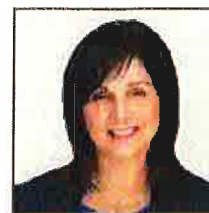
Minister of Primary and Preventative Health Services Adriana LaGrange