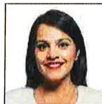
Minister of Indigenous Relations Rajan Sawhney