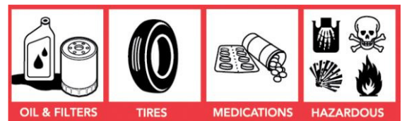
OIL & FILTERS