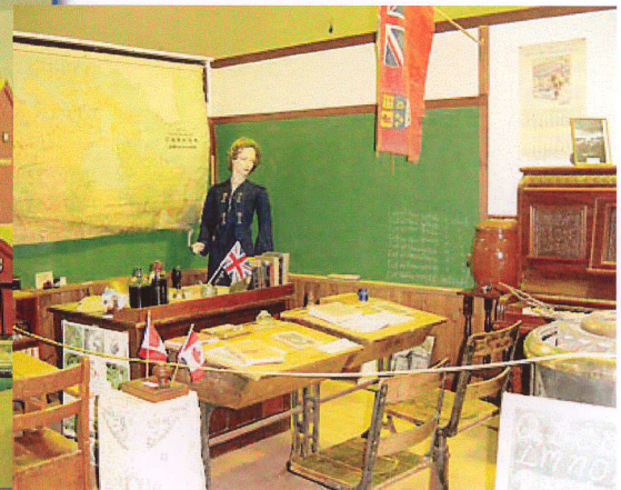
Classroom of days gone by