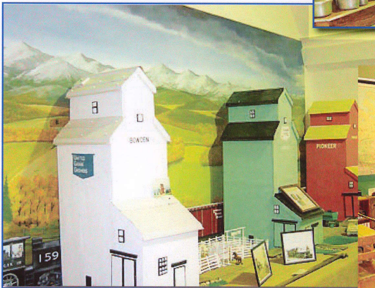
Elevator from the new Disappearing Landscape exhibit